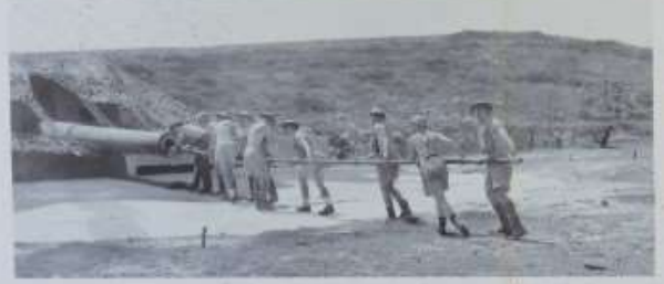
Gunners cleaning the bore of the 9.2 inch Coastal Gun. (1944, AWM Collection 063461).

Rear view of 9.2 inch gun being fired during a practice shoot. (May 1939, RAAHS Collection).