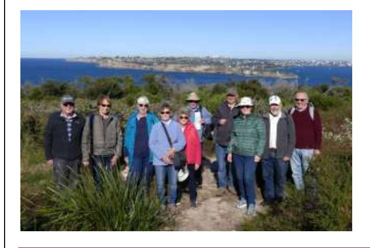
Combined Probus Club of Belrose Newsletter