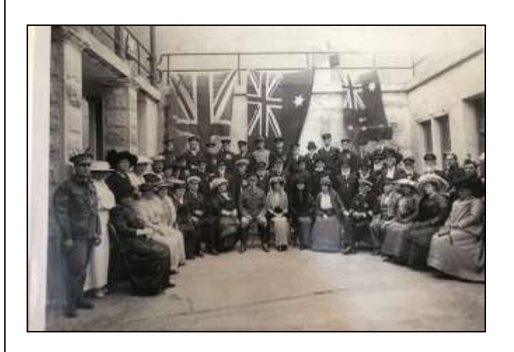
Photo taken on Bare Island pre 1914 Believed to be part of an Empire Day celebration