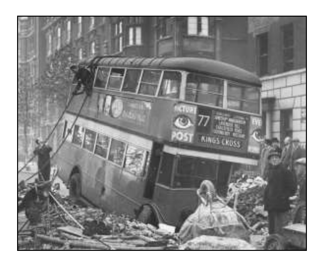
A London Bus sinks into a bomb crater October 1940