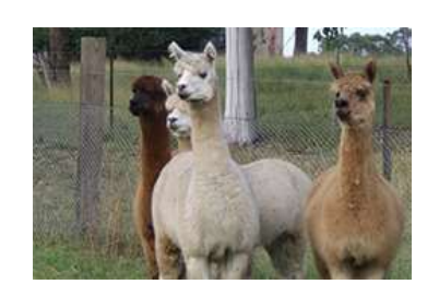
Alpacas, Cider & Pies

We head off, up to the beautiful lower blue mountains. We will visit Tanglin Lodge Alpacas where we will enjoy a lovely Devonshire morning tea before having a tour and talk about the alpaca