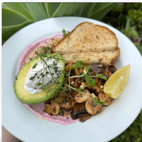
THE MUSHROOM TOAST