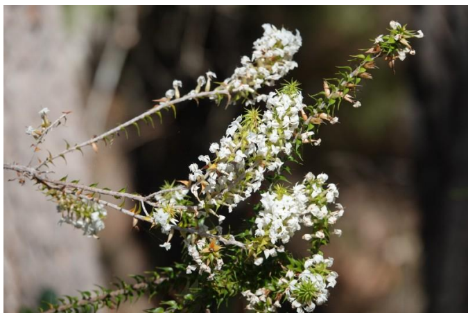
Epacris obtusifolia or Woollsia pungent . Both Epacris family.