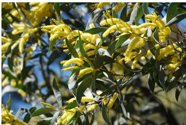
SYDNEY GOLDEN WATTLE. Acacia longifolia