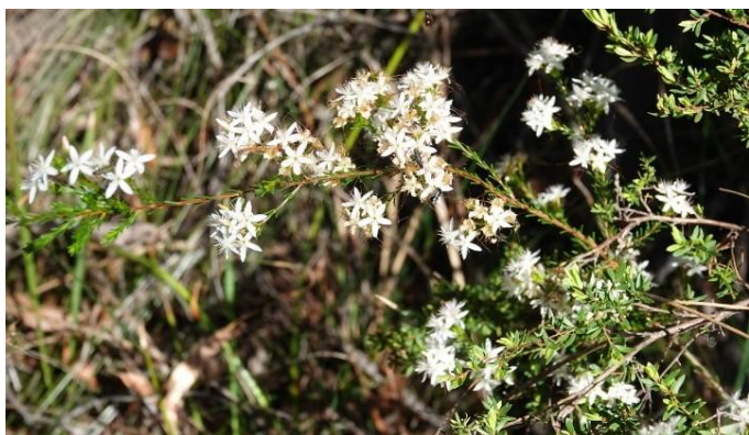
WEDDING BUSH. Ticinocarpos pinifolius