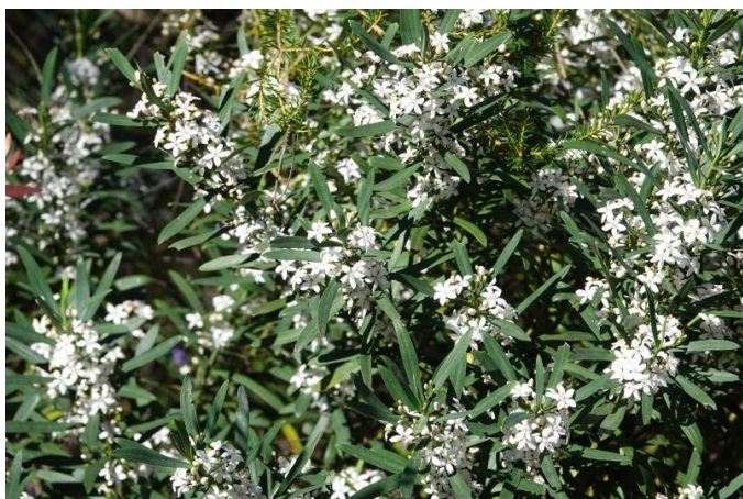
NATIVE DAPHNE. Eriostemon