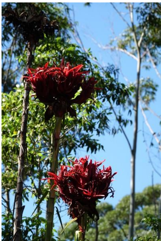
GYMEA LILY. Doryanthes excelsa