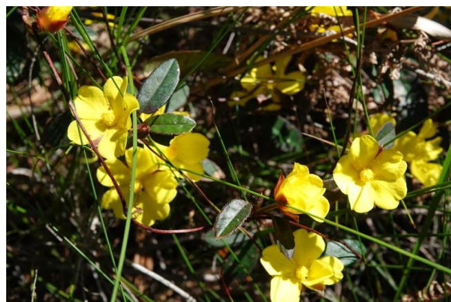
HIBBERTIA. Hibbertia scandens