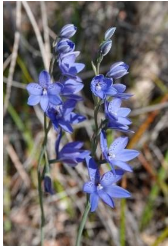
DOTTED SUN ORCHID. Thelymitra ixioides