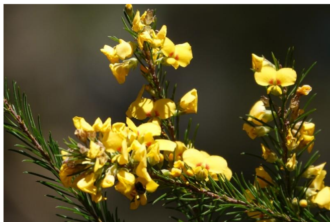
EGG AND BACON, PEA FLOWER. Dillwynia (many pea flowers in different specie)