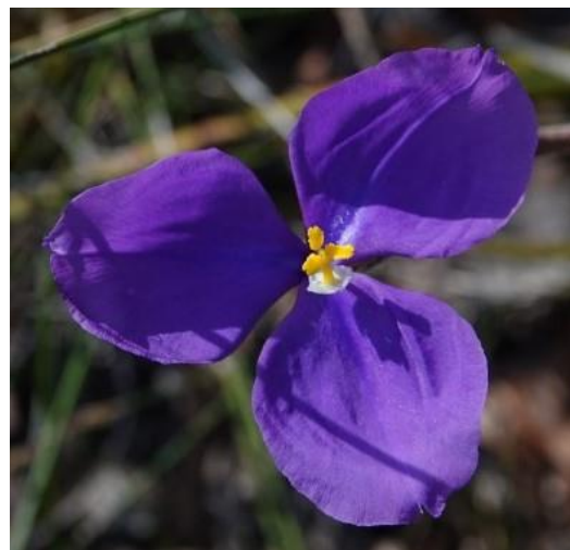
NATIVE IRIS. Patersonia services