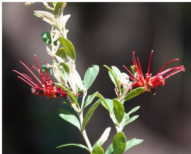
RED SPIDER FOWER. Grevillea speciosa