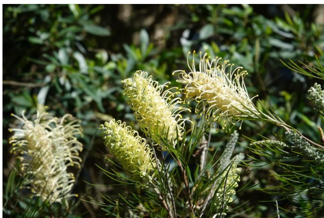
Grevillea "Moonlight". A hybrid Grevillea