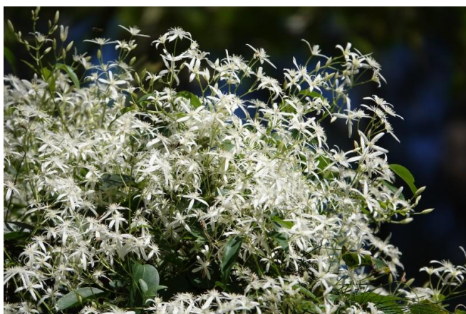
TRAVELLER'S JOY or WEDDING VEIL. Clematis aristata