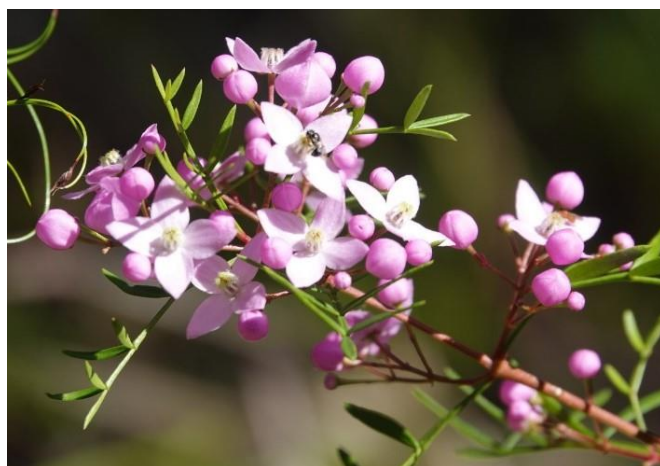
BORONIA. Boronia pinnata