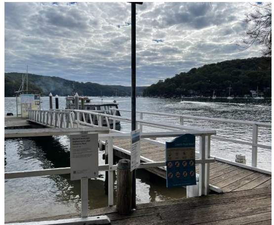
Ferry wharf with Scotland Island at right

Come with us on a Pittwater ferry cruise with morning tea / lunch at the Waterfront Restaurant at Church Point. Start and finish at Glenrose or meet us somewhere on the way. A 3 ½ hour outing in total. Cost $14.50 plus lunch.