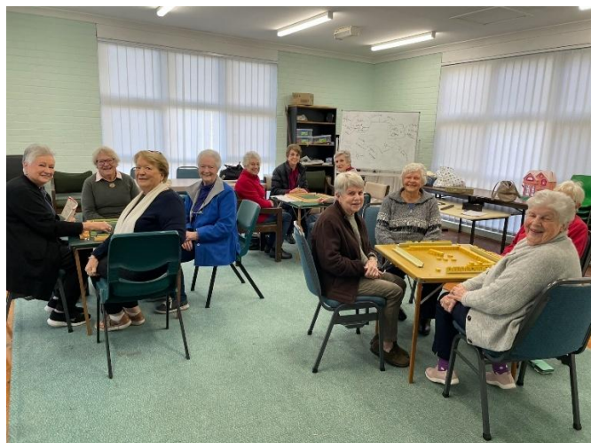
Mahjong Group Wednesday 28 May

Please give me a call if you have any questions.