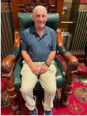
The President's Chair NSW Parliament House

Welcome to February. Another busy and enjoyable month with lots of things on.